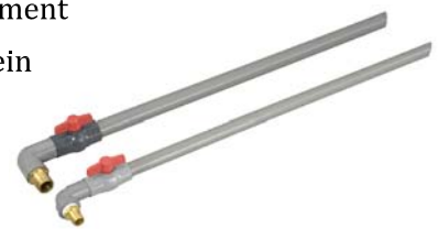
Optional Drum Pickup Kit